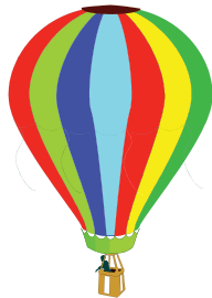
Hot air in balloon